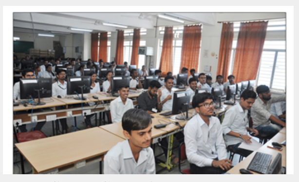
Central Computing Laboratory